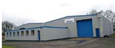
Westex, Sevenoaks, Kent