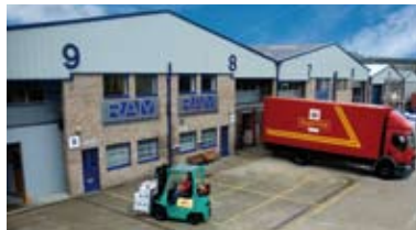
Response Analysis & Mailing, London N4