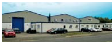
Admail4 & Global Print Management, Sevenoaks