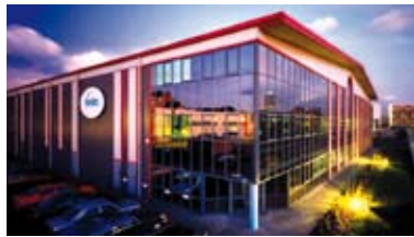
Westex, London E3

If you would like to visit any of the sites we'd be delighted to order you one of our liveried taxi cabs.